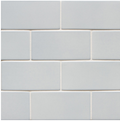
Pale Sky Gloss