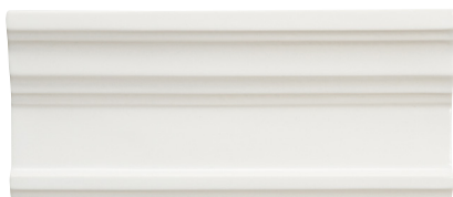
Cornice Molding 3 5/8" x 8 1/2"