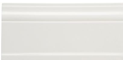
Base Molding 4" x 8 1/2"

6" x 6" Bullnose 3" x 3" and 6" x 6" Double Bullnose 3" x 6" Bullnose Long 3" x 6" Bullnose Short 1 1/2" x 6" Quarter Round and Beak