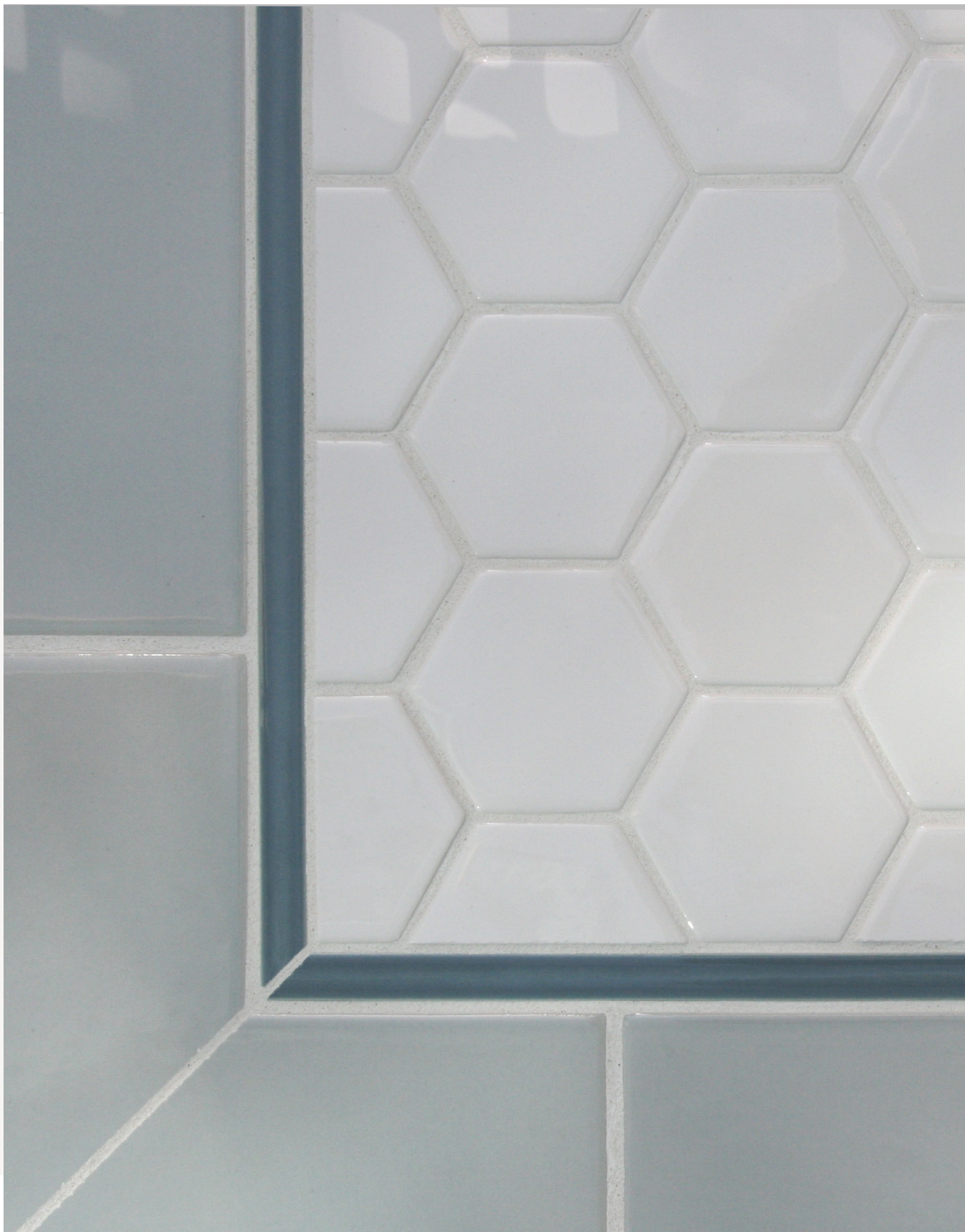
Above Hexagon Mosaic in White Gloss, Stick Liner in Marlin Blue, 3" x 6" Field Tile in Pale Sky Gloss