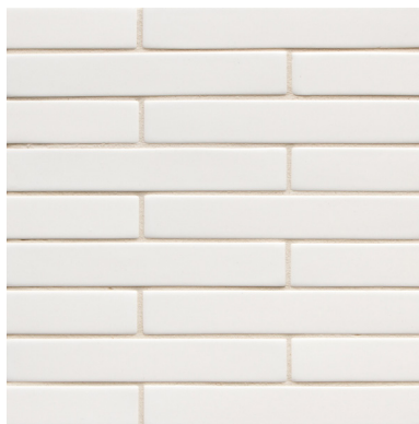
Mosaic 1" x 6"