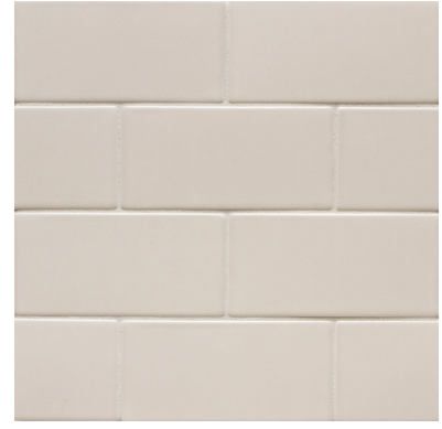
Fog Gloss Also available in a Matte finish