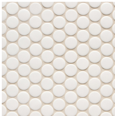
Round Mosaic 1" x 1"