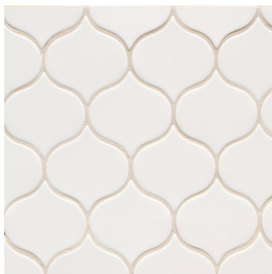
Julia Mosaic 3" x 3 1/2"

Some styles are not stocked in all colors. Please see walkerzanger.com for details.