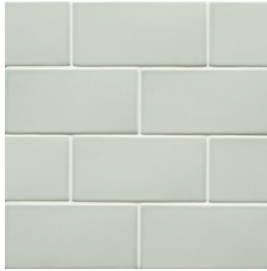
French Clay Gloss