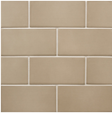
Flax Gloss Also available in a Matte finish