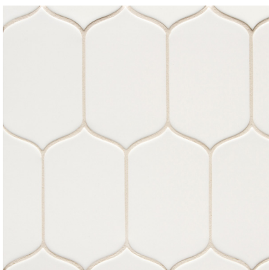
Cocoon Mosaic 3 1/4" x 6"