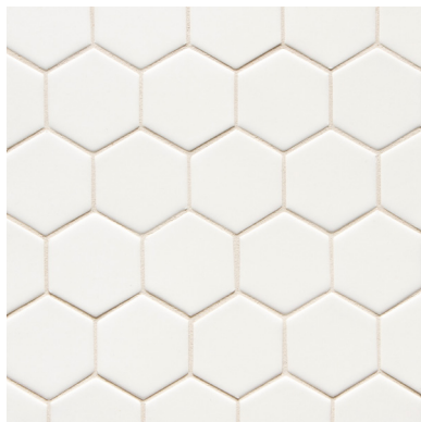
Hexagon Mosaic 2" x 2"