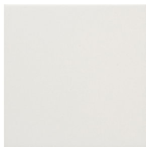
Field 6" x 6"