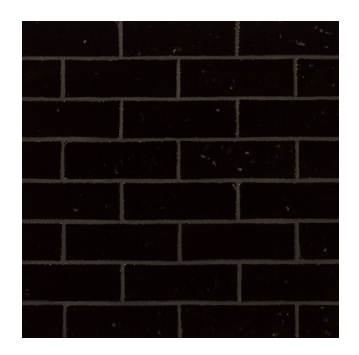
Black Gloss Brick 3" x 9" 1CBRBLKGL39