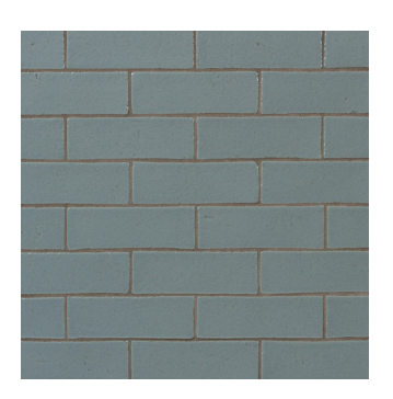
Skyscraper Gloss Brick 3" x 9" 1CBRSKYGL39