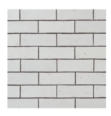
Street Light Matte Brick 3" x 9" 1 CBRSLIMA39