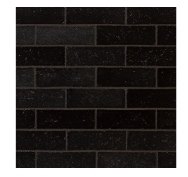
Black Matte Brick 3" x 9" 1 CBRBLKMA39