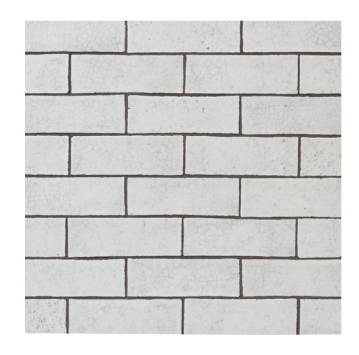
Street Light Gloss Brick 3" x 9" 1CBRSLIGL39