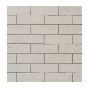
Sidewalk Gloss Brick 3" x 9" 1CBRSIDGL39