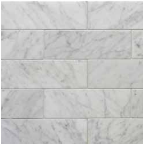
Carrara Honed 3" x 8" field