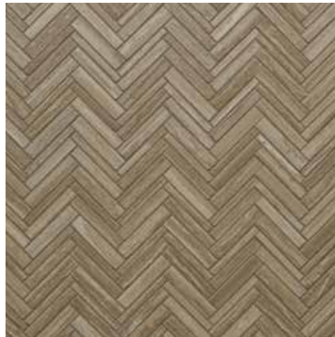
Lounge Mosaic Mocha