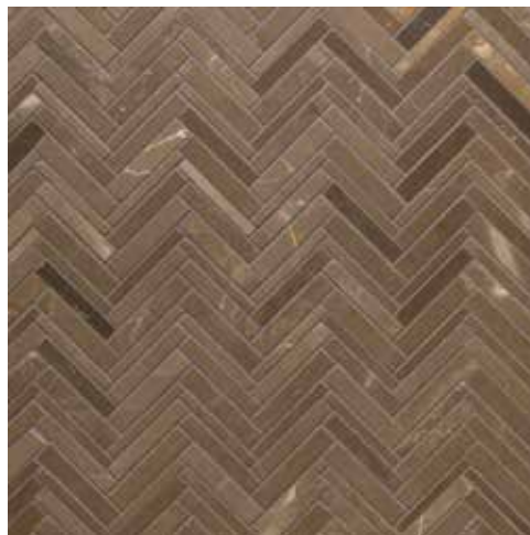
Lounge Mosaic Café Bruno