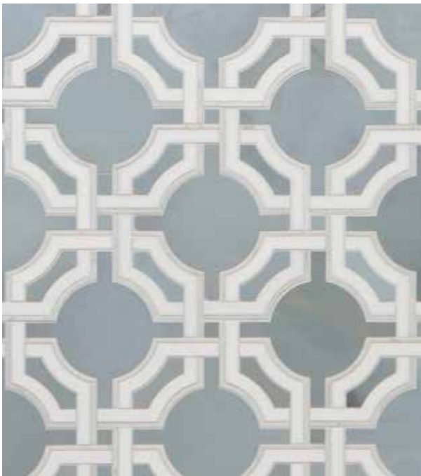
Cabana Cadet Blue