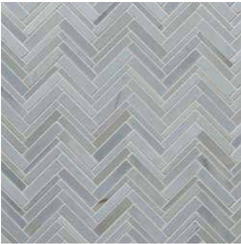
Lounge Mosaic Cadet Blue