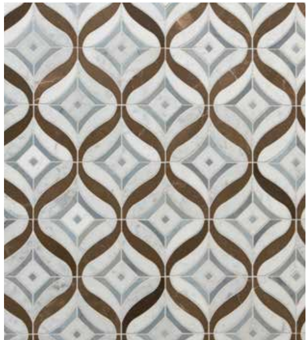
Mai Tai Cadet Blue