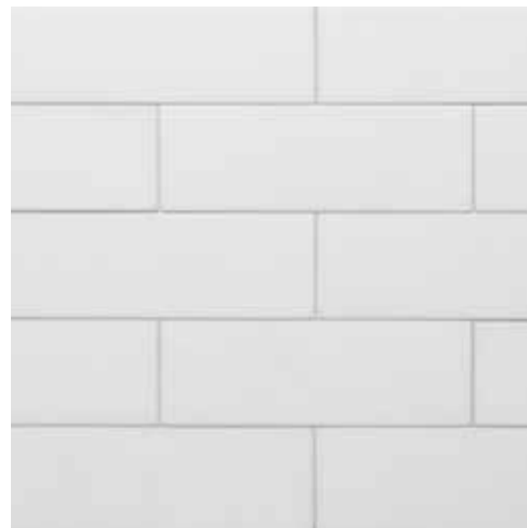
Thassos White 3" x 8" field