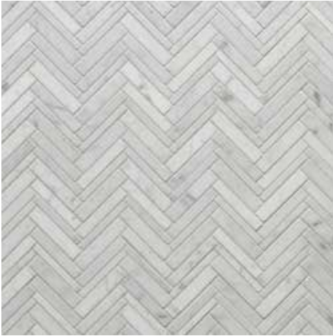
Lounge Mosaic Carrara White