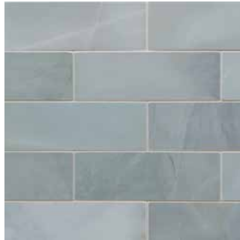
Cadet Blue Honed 3" x 8" field