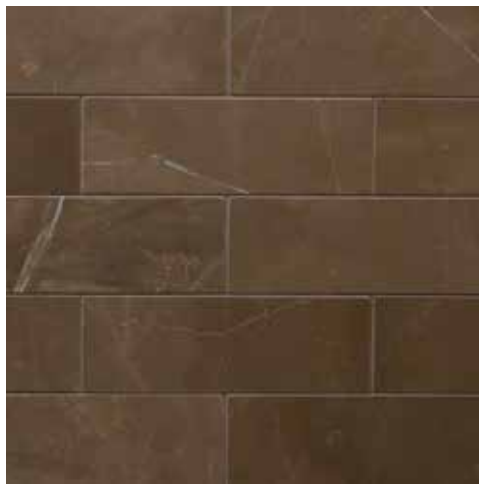
Café Bruno 3" x 8" field