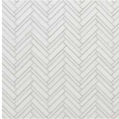
Lounge Mosaic Thassos White