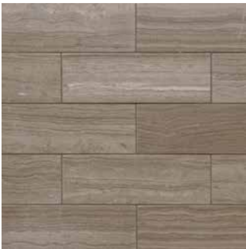
Mocha Honed 3" x 8" field