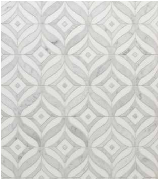
Mai Tai Carrara