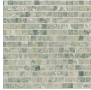
Taj Mosaic Field Celdon Onyx Polished

The luxurious summer palaces of ancient Indian royalty inspired the splendor of the Pasha Mosaic Collection. Fit for any modern lover of luxury, Pasha's unique onyx mosaics shimmer and glisten like jewels. Create your own luxurious oasis with this refined collection.