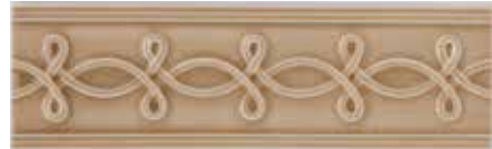
Rivoli Border 2 5/8" x 8 3/4"