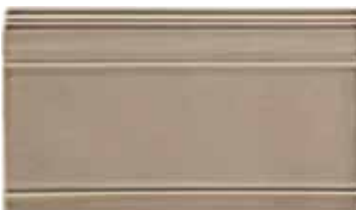
Base Molding 4 3 / 8 " x 7 1 / 2 "