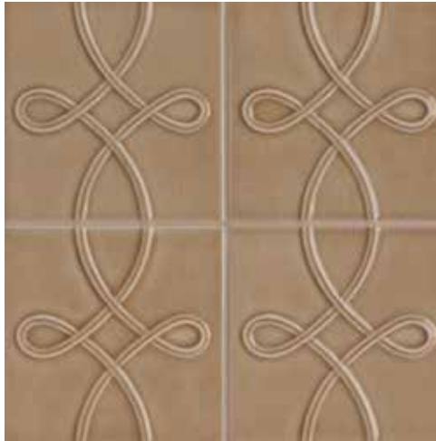
Rivoli Deco Field 5" x 5"