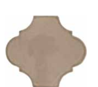
Arabesque Field 6" x 5 1 / 2 "

The Tuileries Collection offers a fresh take on classic French motifs, splendidly reborn in carefully edited decorative patterns, perfectly suited for today's refined interpretation of traditional style. The collection's name is inspired by the Jardin de Tuileries, which is the "central park" of Paris. "Tuile" means tile in French, and this historic park started its life as a clay quarry and tile workshop in the early 13th century. What could be a more fitting name for a collection that celebrates the heritage of French handmade tile and design?