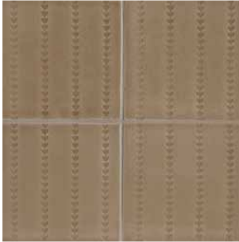
Madeline Deco Field 5" x 5"