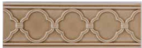
Vendome Border 3 1/4" x 10 1/8"