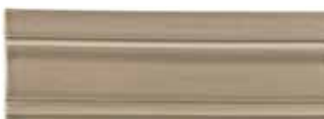
Rail Molding 2 5 / 8 " x 7 1 / 2 "