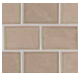
Brique Mosaic 2" x 3"