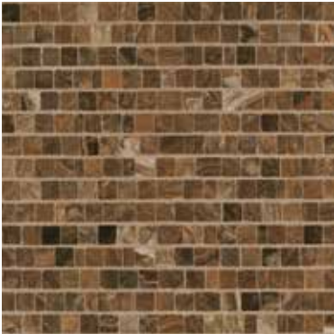
Taj Mosaic Field Clove Onyx Polished