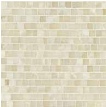
Taj Mosaic Field White Mist Onyx Polished