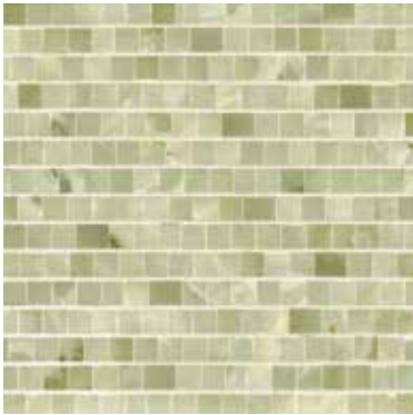
Taj Mosaic Field Green River Onyx Polished