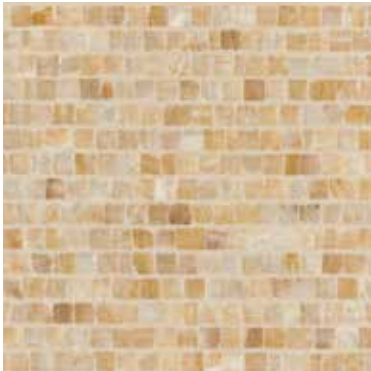
Taj Mosaic Field Honey Onyx Polished

The luxurious summer palaces of ancient Indian royalty inspired the splendor of the Pasha Mosaic Collection. Fit for any modern lover of luxury, Pasha’s unique onyx mosaics shimmer and glisten like jewels. Create your own luxurious oasis with this refined collection.