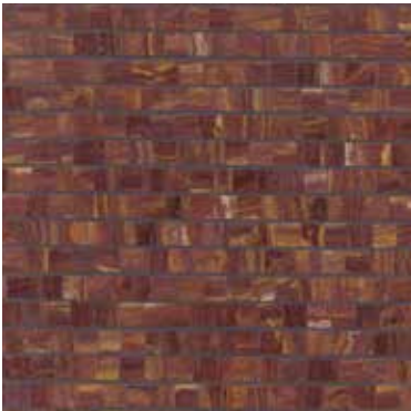
Taj Mosaic Field Raja Red Onyx Polished