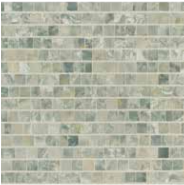
Taj Mosaic Field Celdon Onyx Polished

The luxurious summer palaces of ancient Indian royalty inspired the splendor of the Pasha Mosaic Collection. Fit for any modern lover of luxury, Pasha’s unique onyx mosaics shimmer and glisten like jewels. Create your own luxurious oasis with this refined collection.