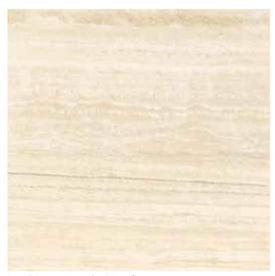
lvory Travertine Vein Cut (Honed) 12" \times 24" \times ^{1}/_{2} "