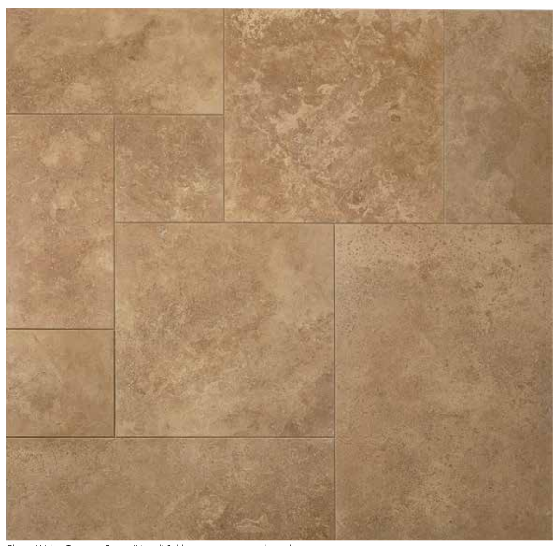
Classic Walnut Travertine Pattern (Honed) Sold as a pattern or in individual sizes. 12" \times 12", 12" \times 24", 24" \times 24", 24" \times 36" – all ^5/8 " thick. Classic Walnut is also available in 18" \times 18" \times ^1/2 " Honed and Unfilled.

Walnut Travertine is prized for its blend of warm browns and rich caramel. Our Classic Walnut is the finest such Travertine available, boasting a consistent palette of light to medium color tones and subtle veining. Rendered in a large-format pattern, Classic Walnut Travertine is an unsurpassed flooring choice for patios and public areas of large residences.