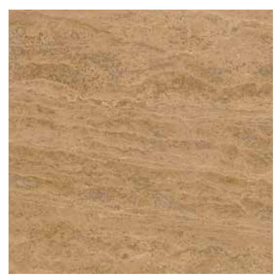
Classic Walnut Vein Cut (Honed) 12" x 24" x 3/8"