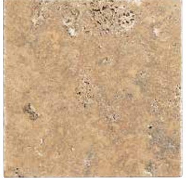
16" x 16" x <sup>1</sup>/<sub>2</sub>"