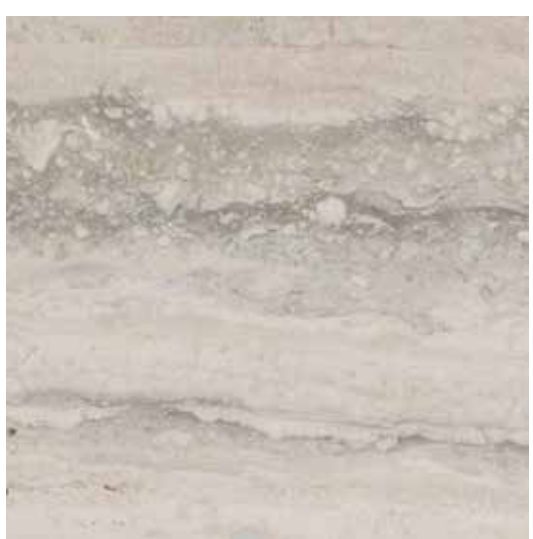
Tuscan Silver (Honed) 12" x 24" x <sup>1</sup>/<sub>2</sub>", Slab