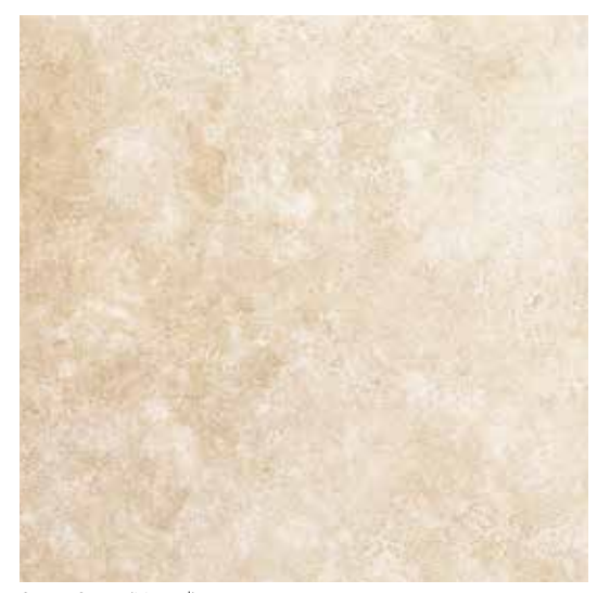
Sierra Stone (Honed) 12" x 12" x <sup>3</sup>/8", 16" x 16" x <sup>3</sup>/8", 24" x 24" x <sup>1</sup>/<sub>2</sub>", Slab