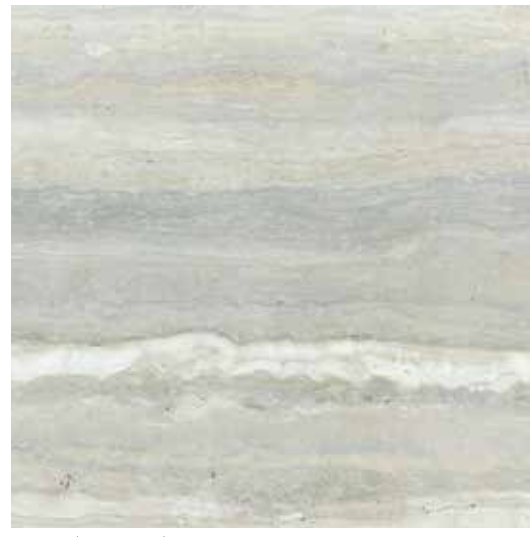
Siena Silver (Honed) 12" x 24" x <sup>1</sup>/<sub>2</sub>", Slab