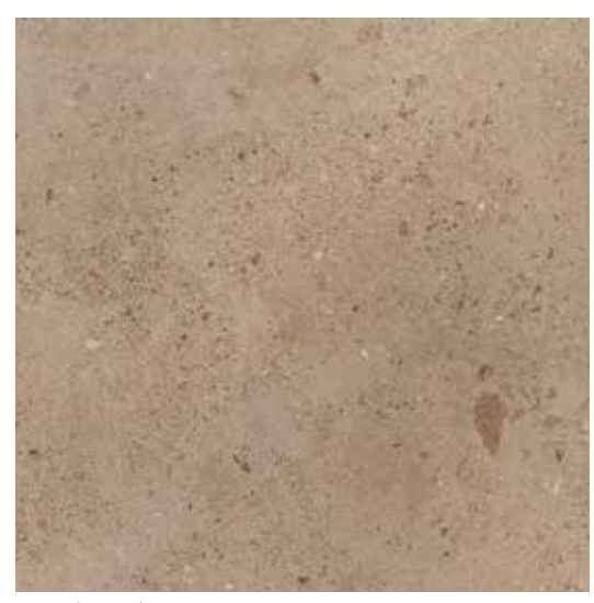
Pietra dei Medici 24" x 24" x <sup>1</sup>/<sub>2</sub>"