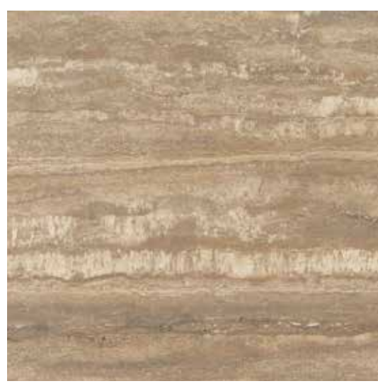
Prado (Honed) 12" x 24" x <sup>3</sup>/<sub>8</sub>", 18" x 36" x <sup>3</sup>/<sub>8</sub>", Slab