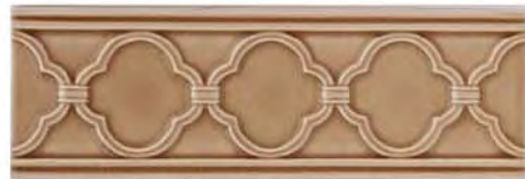
Vendome Border 3 1/4" x 10 1/8"