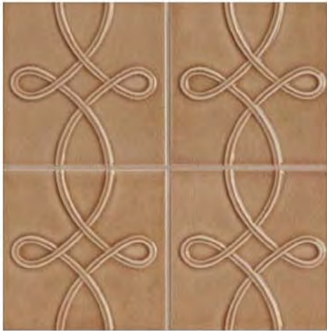
Rivoli Deco Field 5' x 5'