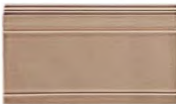
Base Molding 4 3/8' x 7 1/2'