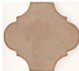
Arabesque Field 6' x 5 1/2'

The Tuileries Collection offers a fresh take on classic French motifs, splendidly reborn in carefully edited decorative patterns, perfectly suited for today's refined interpretation of traditional style. The collection's name is inspired by the Jardin de Tuileries, which is the "central park" of Paris. "Tuile" means tile in French, and this historic park started its life as a clay quarry and tile workshop in the early 13th century. What could be a more fitting name for a collection that celebrates the heritage of French handmade tile and design?