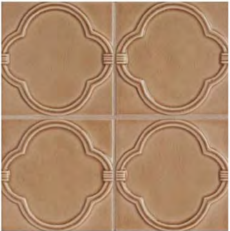
Vendome Deco Field 5' x 5'