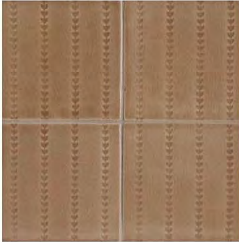
Madeline Deco Field 5' x 5'