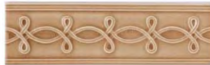
Rivoli Border 2 5/8" x 8 3/4"