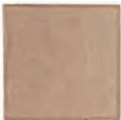
Field 5' x 5'