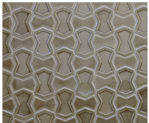
Parker Mosaic in Suede