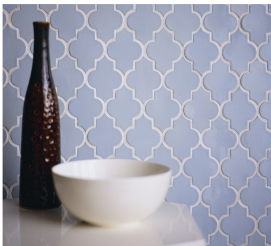
Ashbury Mosaic in Powder Blue