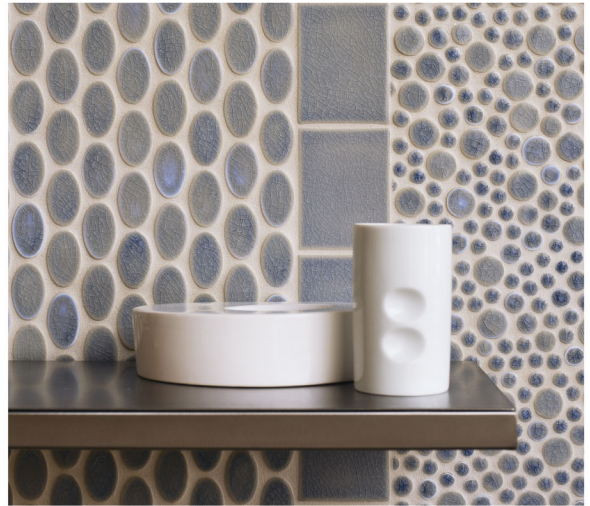
Oval and Orbit mosaic, with 3"x4" Field, all in Blue Shadow