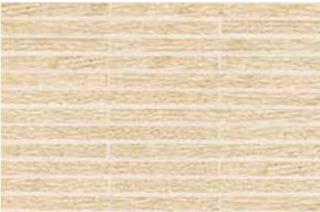
Offset Mosaic 1/2" x 9" Mesh Mounted