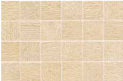
2' x 2' Mosaic Mesh Mounted

Tatami’s unexpected texture was inspired by the woven floor mats traditionally found in Japanese homes. Applied to limestone by highly skilled craftsmen, this surface conjures a beguiling visual softness while maintaining all the durability of stone. Tatami is offered in a variety of forms, from oversized tiles to elongated mosaics and is perfectly suited for Zen, Modern or Spa inspired spaces.