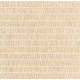
Straight Set Mosaic 1/2" x 9" Mesh Mounted