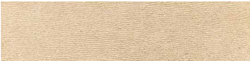
6' x 24'