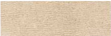
4' x 12'