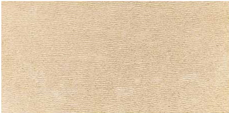
12' x 24'