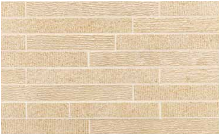
Random Rectangle Mosaic Mesh Mounted