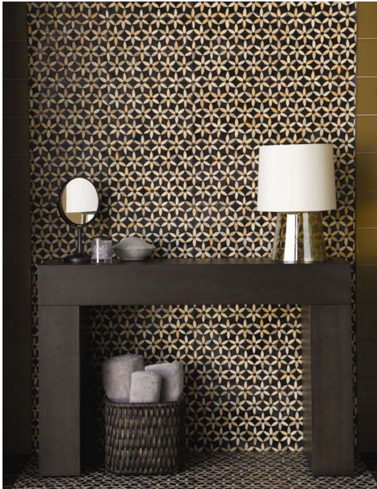
La Fluer Noir Pattern

Sonja gives a modern spin to classic mosaic designs from the past. Graphic colorways and intricate all over patterns enliven the collection, which is hand crafted by mosaic artisans in Tunisia, where the rich heritage of mosaic craftsmanship reaches back thousands of years.