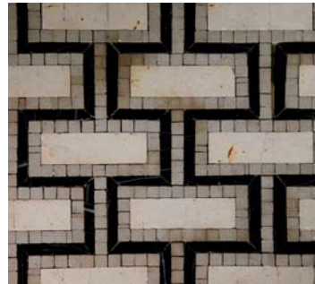
Nash Pattern cream/black