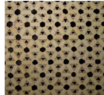
Abazzia Pattern cream/black