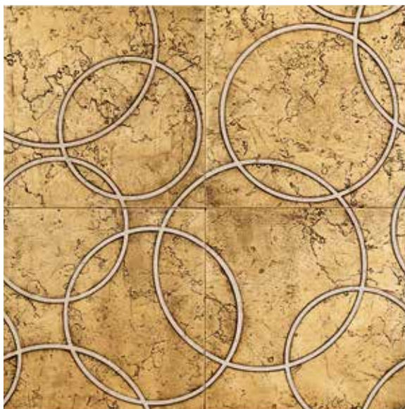
Circolo Pattern, Gold on Bianco 12" x 12"

Taking decorative stone to new heights, Tracciato blurs the line between decoration and fine art. Hand-crafted in a small workshop in the Veneto region of Italy, each tile is carefully etched to create a dimensional relief that is accented with hand-applied gold or silver leaf. These stunning tiles will certainly be a treasured element of any home they grace.