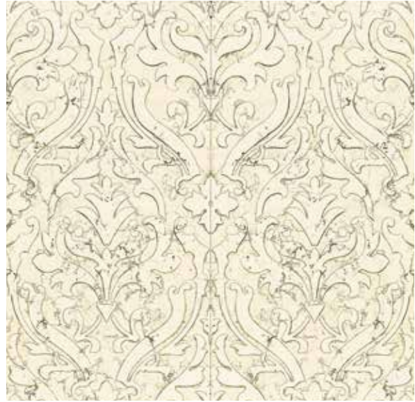
Vicenza Pattern, Biancone Natural 12" x 24"