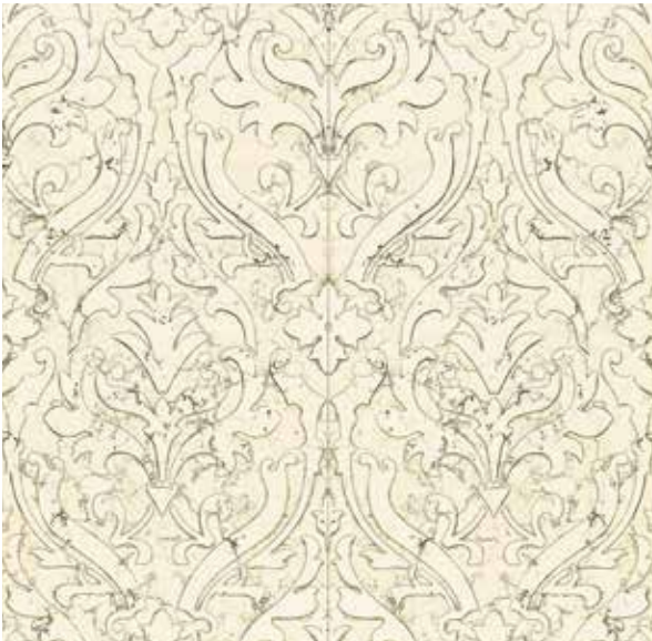
Vicenza Pattern, Biancone Natural 12" x 24"