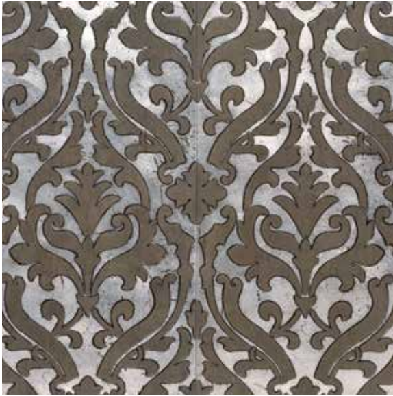
Vicenza Pattern, Silver on Flannel 12" x 24"