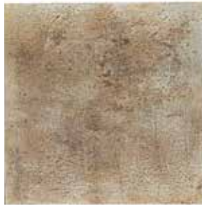
Silver Leaf Field 12" x 12"