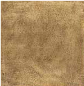
Gold Leaf Field 12" x 12"