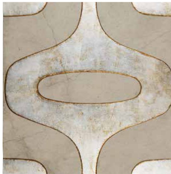
Haley Pattern, Smoke 24" x 24"