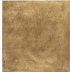
Gold Leaf Field 12" x 12"