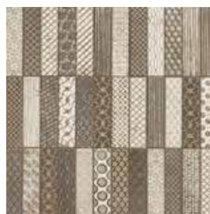
Diva Pattern 1" x 4"