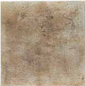
Silver Leaf Field 12" x 12"