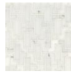
Calacatta Honed Finish