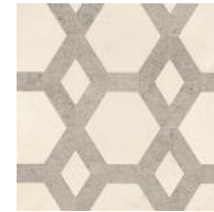
Paloma/ Gascogne Blue