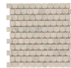
Tuscan Taupe Limestone