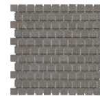
Gateway Grey Limestone