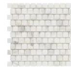
Windsor White Marble