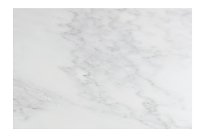
BLANC 12" x 18" ANTIQUED 2RPIBAN1218