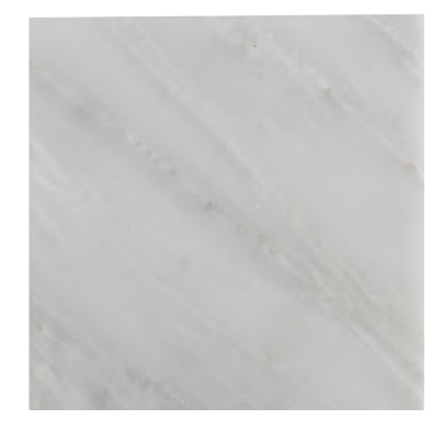
GRIS 3" x 3" ANTIQUED DOT 2RPIGAND