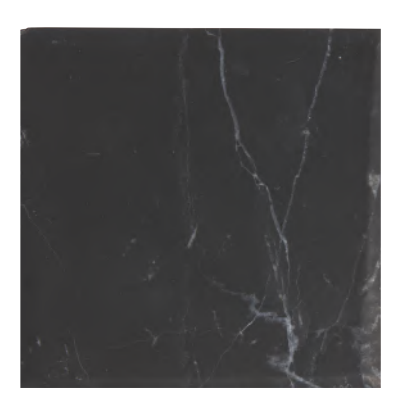
NOIR 3" x 3" ANTIQUED DOT 2RPINAND