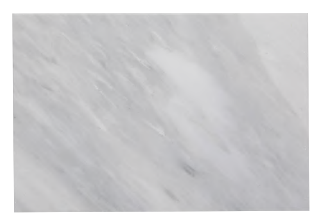
GRIS 12" x 18" ANTIQUED 2RPIGAN1218