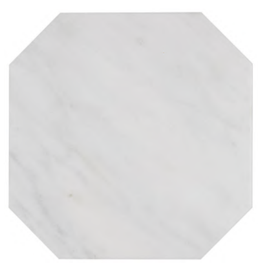
BLANC ANTIQUED 12" OCTAGON 2RPIBANOCT

For installation on shower floors on all products, please refer to TCNA guidelines and consult with your installer for proper waterproofing and sealing requirements. All available Rue Pierre tiles are natural stone products. We recommend sealing all natural stone products with a penetrating sealer and sealing all porous non-polished stone (limestone, tumbled marble, etc.) prior to grouting. This prevents grout from staining or affecting the color of the stone. Stone is a natural product, and care should be taken to protect it from harsh abrasive cleaners and abrasive cleaning tools. White thin-set or mortar is required for the following: light limestone, tumbled stones, "antiquated stones" and light-colored marbles. It is possible that dry seams, pits, fossils, and glass veins are often filled at the factory. The fill may perhaps leak through the voids. In this case, refilling the voids may be a necessary maintenance procedure. For further questions/information about additional usages, please consult with your installer.