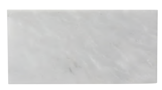
BLANC 3" x 6" ANTIQUED 2RPIBAN3X6