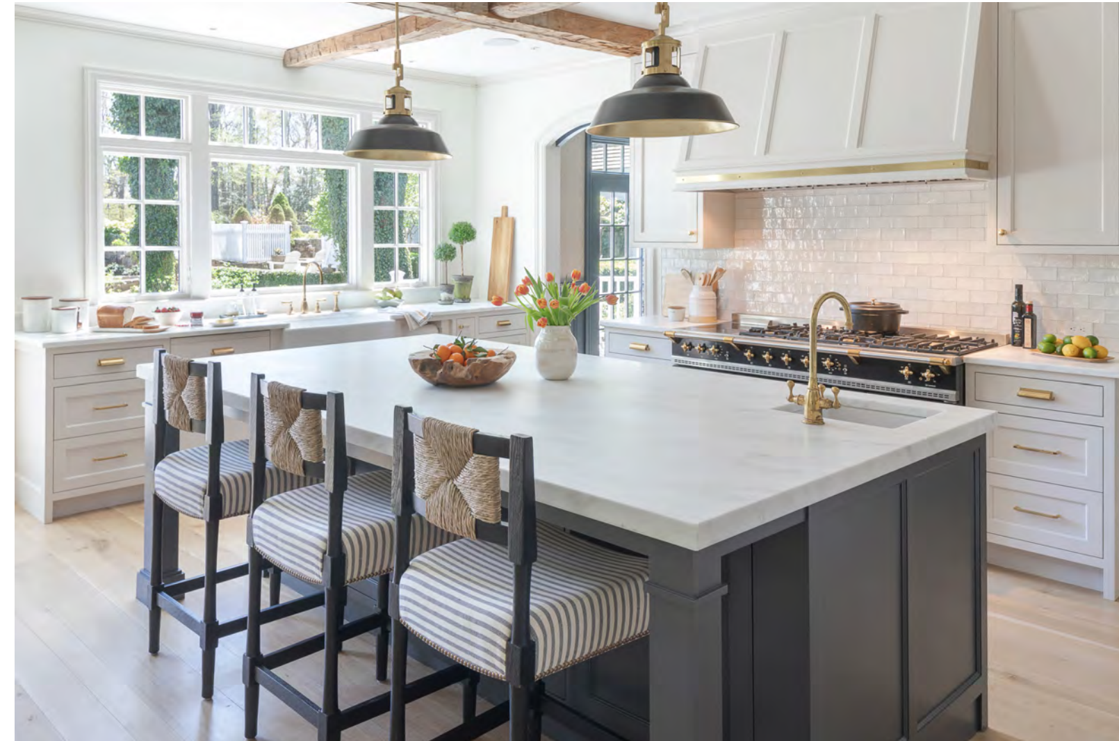
TIM LEE PHOTOGRAPHY