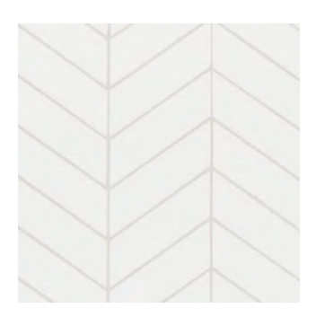
PATTERN: CHEVRON SIZE: 10-3/8" X 10"