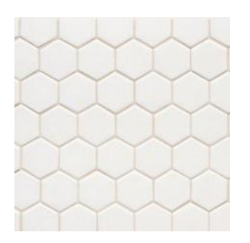
PATTERN: 2" HEX MOSAIC