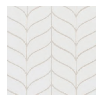
PATTERN: CURVED CHEVRON SIZE: 7-11/16" X 8-7/8"