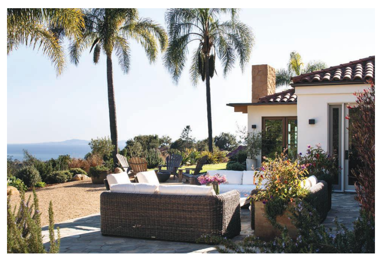
Sofa and chairs from Universal Furniture enhance outdoor living with mountain and ocean views.

has been described as 'modern classic,' resulting in warm, layered homes with very clean lines," says Valencich, who explains that translates into contemporary environments warmed by natural materials as well as traditional homes freshened with modern elements. "Most importantly, I want our designs to be relaxed and effortless, but I always try to achieve a degree of elegance," states the designer.