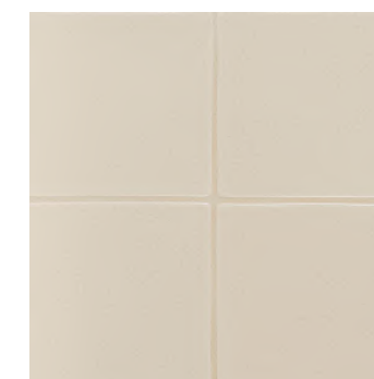
BONE CHINA 1GPABCH CRACKLE FINISH