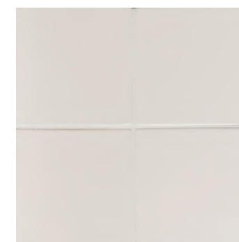
HEIRLOOM WHITE 1GPAHWH GLOSS FINISH