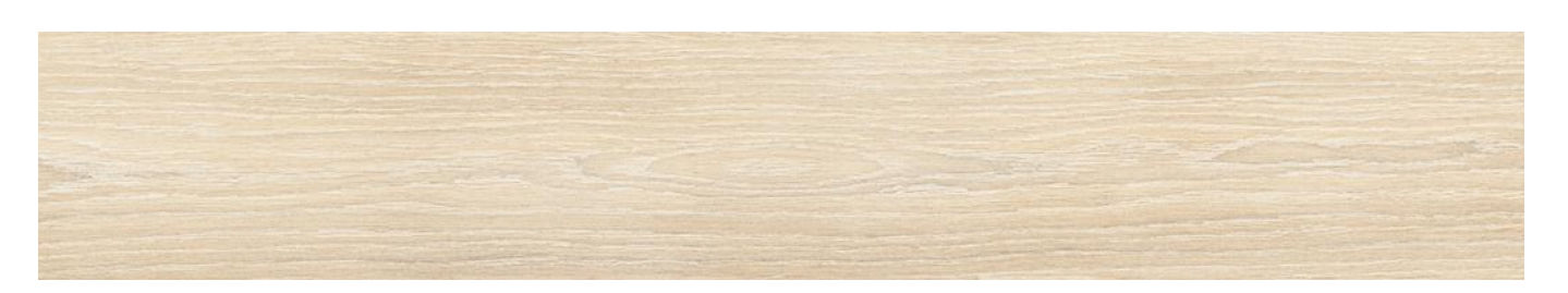
NEUTRO 10" x 71" FIELD TILE* 1071POTNENCMATRGNEUTR