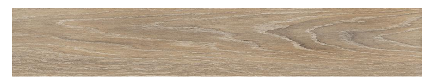
DUNA 10" x 71" FIELD TILE* 1071POTDUNCMATRGDUNAA

All 10"x71" field tiles are available through special order only. For installation on shower floors on all products, please refer to TCNA guidelines and consult with your installer for proper waterproofing and sealing requirements. For questions about additional usages, please consult with your installer.