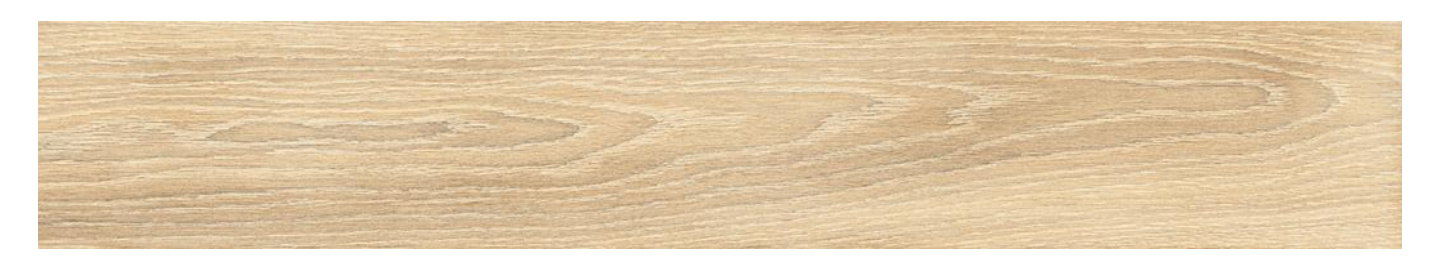
MIELE 10" x 71" FIELD TILE* 1071POTMINCMATRGMIELE