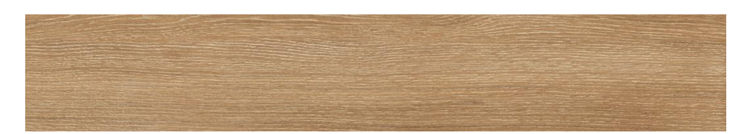
COGNAC 10" x 71" FIELD TILE* 1071POTCONCMATRGCOGNA