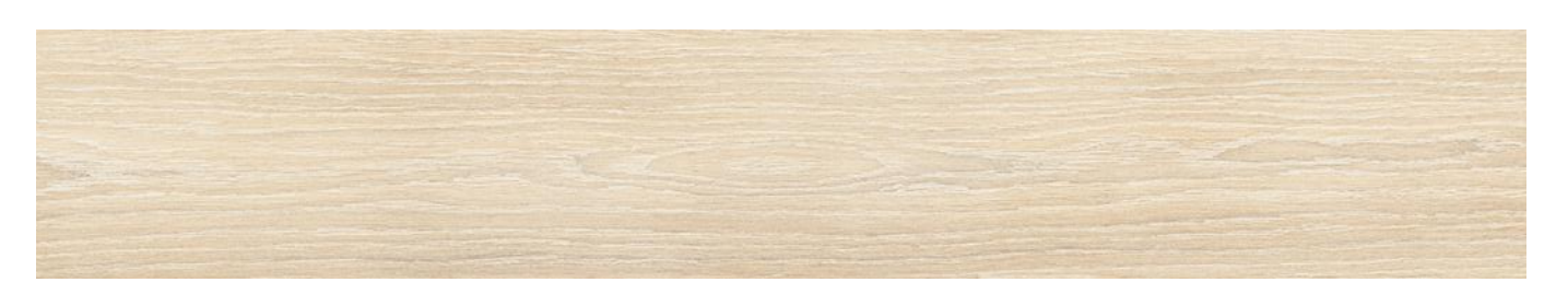
NEUTRO 8" x 48" FIELD TILE 0848POTNENCMATRGNEUTR