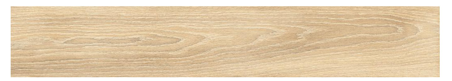
MIELE 8" x 48" FIELD TILE 0848POTBENCMATRGMIELE